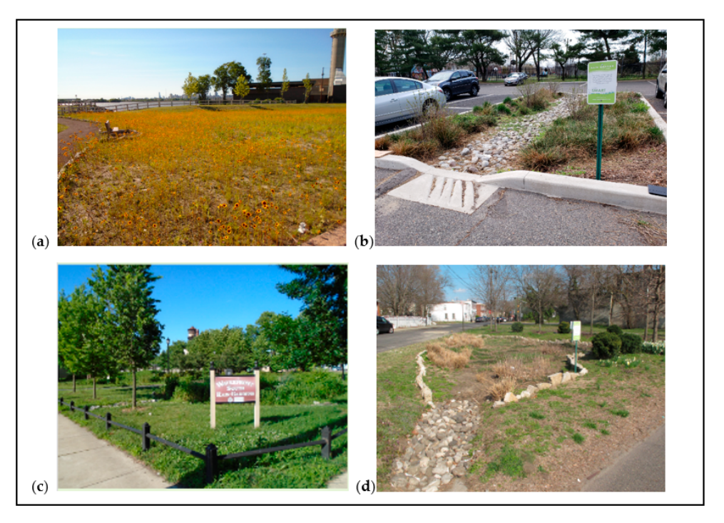
Figure 2. Photos of sample GSI projects in Waterfront South (specific locations marked on map in Figure 1): (a) a wildflower meadow in Phoenix Park; (b) a small rain garden in a publicly owned parking lot; (c) a pocket park comprising several rain gardens and vegetated areas; (d) a rain garden in a publicly owned vacant lot.