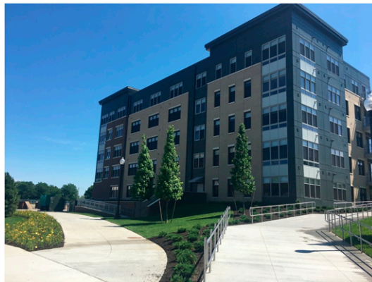
Fig. 1. If not done right, green infrastructure, such as that shown here in East Boston, is potentially a source of climate injustice.

Green infrastructure and urban greening projects—green roofs, resilient parks and greenways, rain gardens, or detention basins and canals—are often hailed as ways to protect cities against climate change impacts.