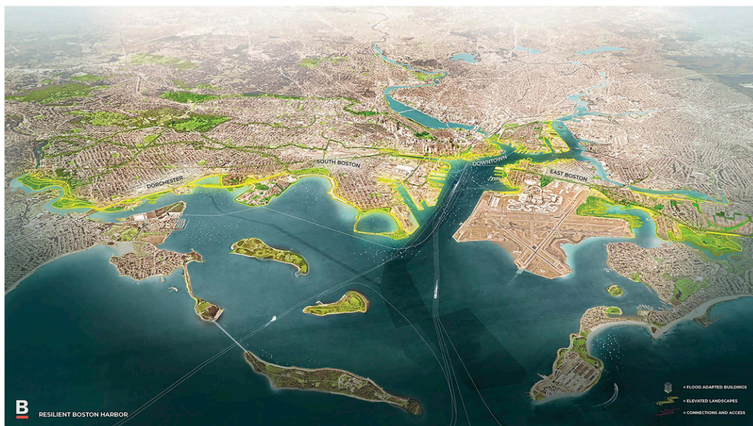
Fig. 2. Green strategies along Boston's shoreline aim to increase access and open space along the waterfront while better protecting the city during a major flooding event.

Yet, recent research suggests that green infrastructure planning for climate change is rooted in a green and resilient city orthodoxy (16, 17) that integrates nature-driven solutions into urban sustainability policy. This orthodoxy, as we have argued in previous research, either overlooks or minimizes negative impacts for socially vulnerable residents while selling a new urban brand of green and environmentally resilient 21st-century city to investors, real estate developers, and new sustainability-class residents (7, 18).